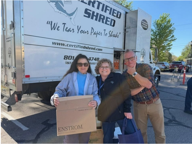
Ogden Golden Hours Shred Event on 5/19/2026