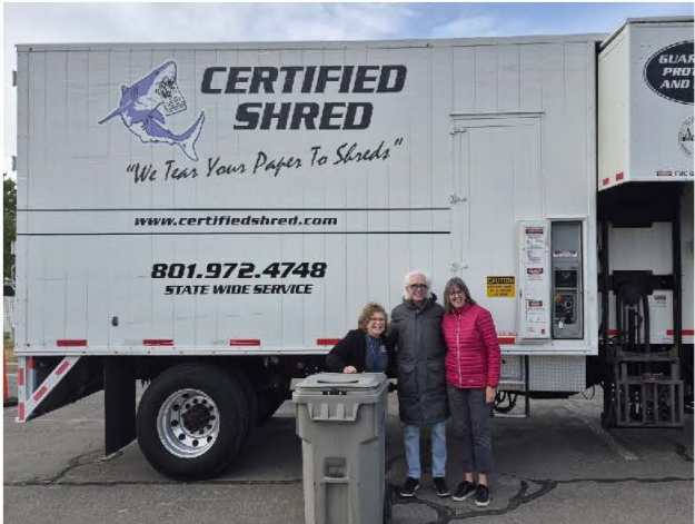
Roy Senior Center Shred Event on 5/18/2026

Blood Pressure Check: Blood pressures taken at your request at the front desk!